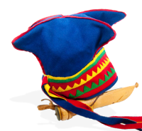
Roots at the Arctic Circle